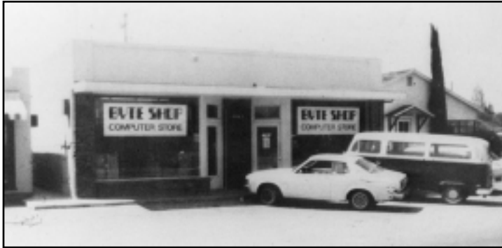
The Byte Shop at 1063 El Camino Real West in Mountain View, California, was the first retail computer store chain in the world and Apple's first big customer.