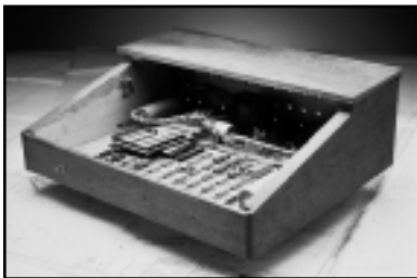
The original Apple I (shown here in a custom-built wooden case) was little more than a circuit board to which customers were expected to add a case, power supply, monitor, and keyboard.

The next day, a barefooted Jobs dropped in on Terrell at his store in Mountain View and exclaimed, "I'm keeping in touch." To Jobs' utter amazement, Terrell agreed to buy 50 computers for $500 each, cash on delivery. There was only one catch to the $25,000 order: Terrell wanted fully assembled computers.