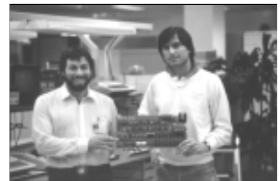
Steve Wozniak (left) and Steve Jobs, showing off the Apple I motherboard that started it all.

"Steve Wozniak looks like a Steiff Teddy bear on a maintenance dose of marshmallows."