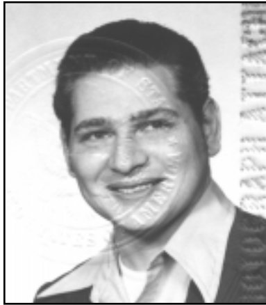
Ronald Gerald Wayne, Apple's forgotten founder, seen here in a passport photo from 1975 (imprint of USA Department of State seal still evident).

Jobs was freelancing at Atari in the early 1970s when founder Nolan Kay Bushnell hired Wayne as chief draftsman (badge #395) for the video game maker. Despite the difference in their ages, Jobs and Wayne became casual friends and would often have philosophical discussions on the ethics of making money. Desiring a tie-breaker in any potential conflicts with Woz, Jobs enticed Wayne to become a partner in Apple by offering him 10 percent interest in the company.